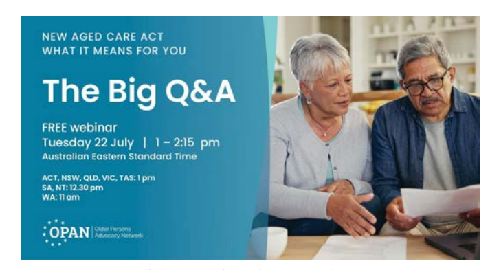
Register now - https://opan.org.au/event/big-q-and-a/